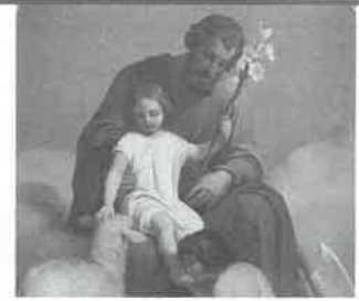
Pope Francis proclaims "YEAR OF ST JOSEPH"