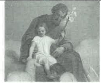
Pope Francis proclaims